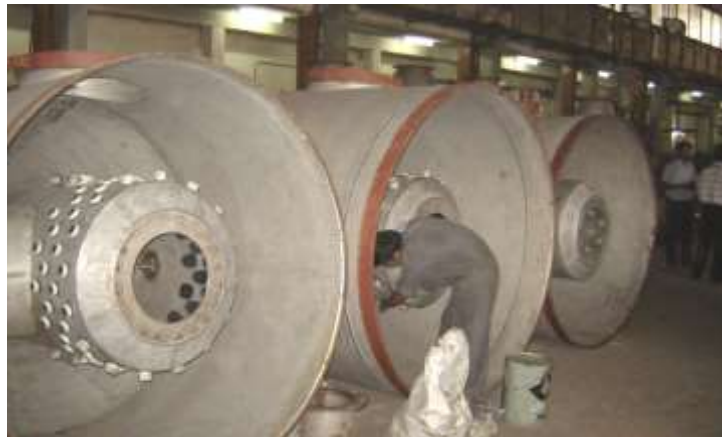
Figure 1 Condensers for sugar plants

VED stands for vital, essential, and desirable items. This type of classification is most applicable to spare parts. The basis of the VED classification is that, if the non-availability of an article shuts the process completely and there is no standby unit as spare then the item comes under vital items. If the non-availability of an item reduces the output but does not shut down the process, then it goes to an essential category, whereas if the non-availability of the item does not affect the efficiency, the item is called desirable. VED classification is done in consultation with the user department [12]. The questionnaire is circulated to the user and according to their feedback; they are classified as Vital, Essential and Desirable items. The same itemised list is used to prepare a questionnaire for VED analysis.